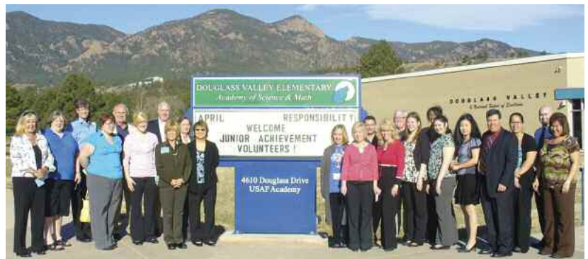
Security Service Federal Credit Union and the Better Business Bureau of Colorado Springs teamed up for JA in a Day at Douglass Valley Elementary