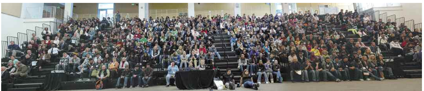
Students fill the gymnasium stands at the University of Colorado at Colorado Springs for the 3rd annual 21st Century Skills Forum.