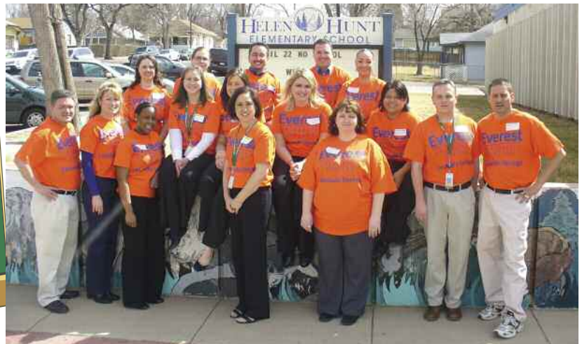
Everest University Online volunteered at Helen Hunt Elementary School