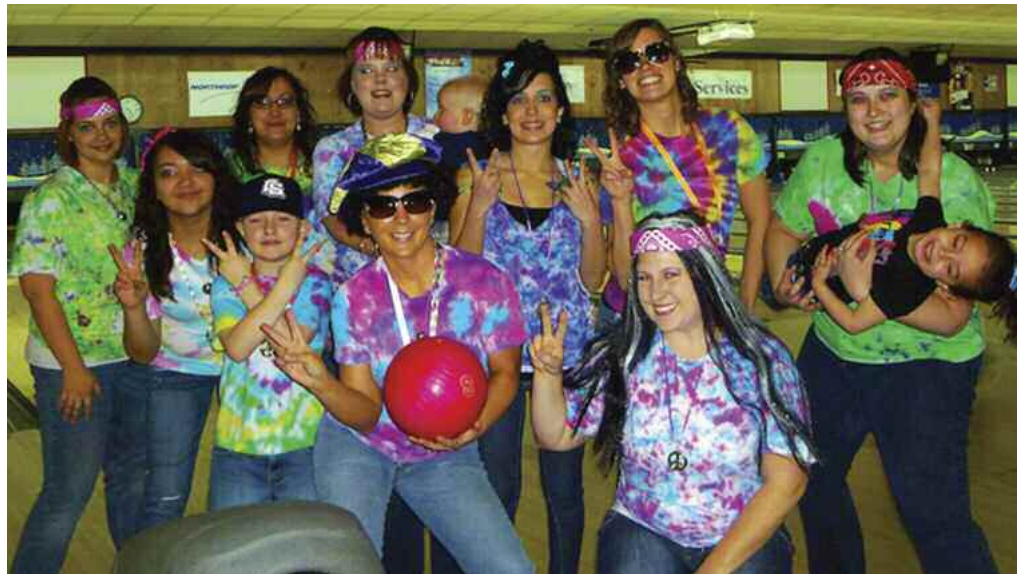
Peace and love was the theme of the day as teams and their fans dressed in '70s funky duds to get in the spirit of the competition.