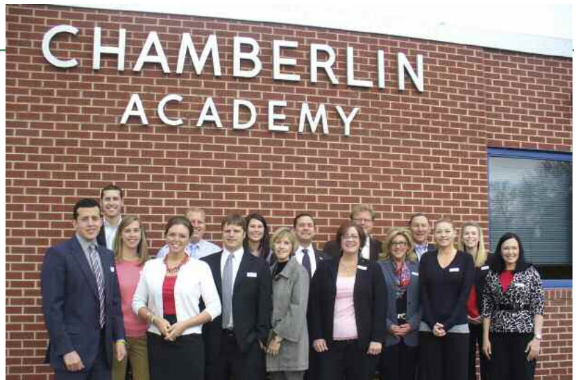
Northwestern Mutual volunteers chose Chamberlin Academy for JA in a Day