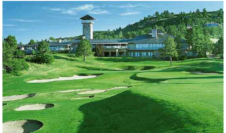
The signature 18th hole at Castle Pines Golf Club